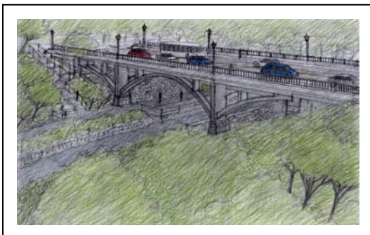
Bridge Alternative 4