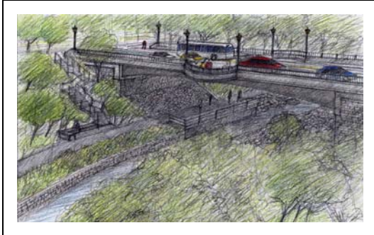
Bridge Alternative 2